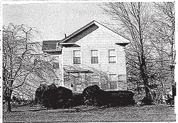
1221 Middle Street

date: 1184:3/79;1221:12/78 view: 1184:west;1221:east negative on file: 1184: Roll 61, #15A; 1221: Roll 51, #33