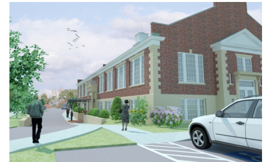
Front & North Side

Renovation of Eckersley-Hall School a State Listed Historic Building 61 Durant Terrace