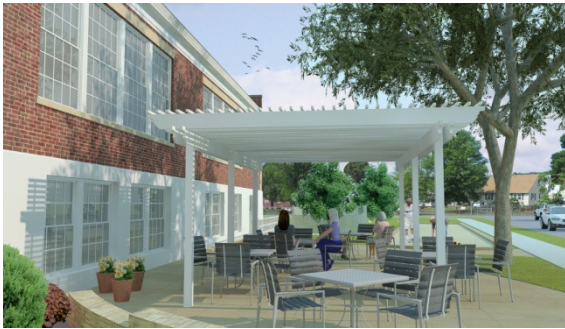
West Side & Rear Patio